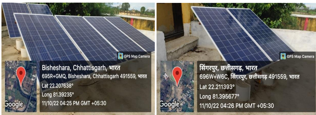
Pic: - The Solar Panels grid is planted on the roof top of the college as an alternative source of energy.